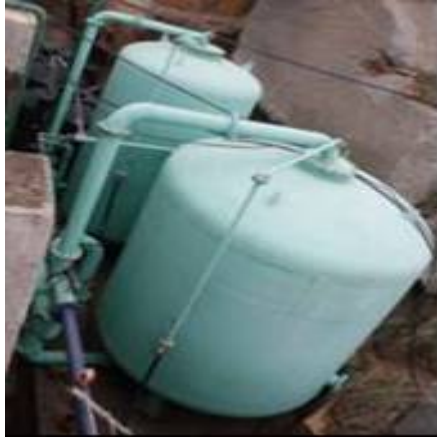
Pic : Water Treatment Plant

4. Storm Water: The Storm Water drainage network and peripheral areas are completed including apartment block Storm Water ring. As part of the environmental sustainability and innovative eco-sensitive Project Implementation, HCPL has undertaken installation of rain harvesting system as value addition to the project.