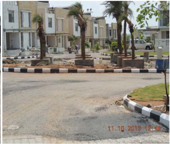
Pic: Internal road in Stage V

7. Gas Connection: The Gas Connection for the Tower blocks has been obtained. An agreement has been completed with HPCL for supply of Gas to the Gas Banks in Hill County. The prepaid metering facility is in place and coordination activities have been outsourced to M/s Futuristic Gas Company, an intermediary who would coordinate with Hindustan Petroleum Company Limited regarding refilling, billing and other customer issues.