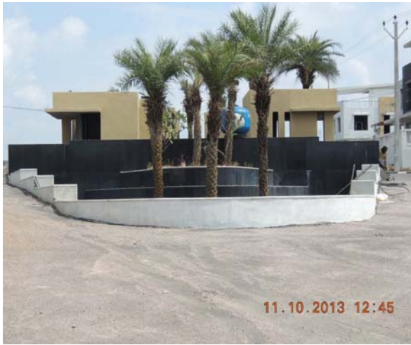
Pic: Fountain at Stage V Entrance