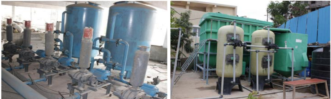
Pic: 1 MLD Sewage Treatment Plant Pic 2 : 0.25 MLD Sewage Treatment Plant

2. Sewerage: The structural work for the Permanent Sewage Treatment Plant has been completed and installations of equipment including commissioning activities are satisfactorily done. The system performance will be tested based on levels of occupancy and required feed to the Plant is available. Mobile packaged STPs units are already installed at site to cater immediate requirements.